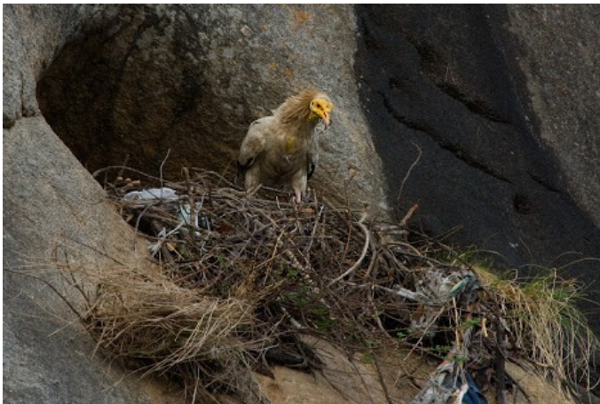
Egyptian Vulture at Devarbetta, Jowlagiri Range