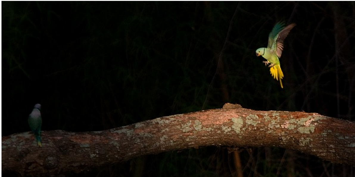
Blue-winged Parakeet at Aiyur, Denkanikottai Range