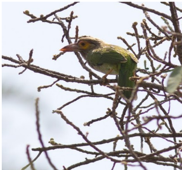
Brown-headed Barbet, Anebiddahalla, Anchetty Range

35 out of the 59 species that represent Biome-11 (Indo-Malayan Tropical Dry Zone) have been documented.