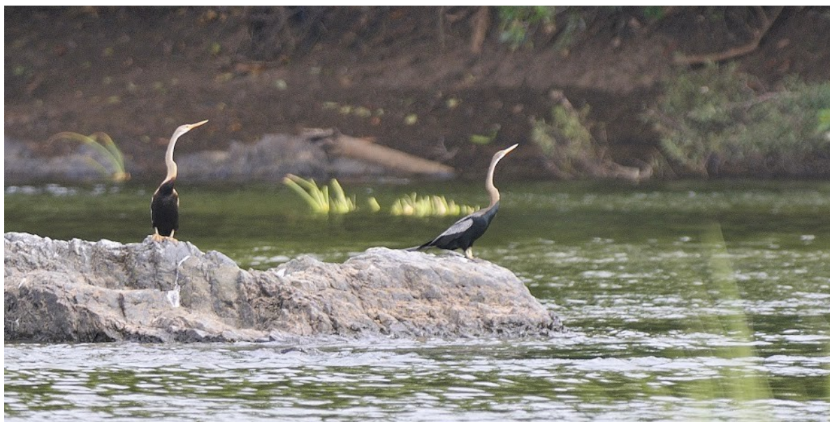
Darters at Dabaguli, Urigam Range