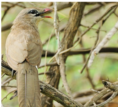
Sirkeer Malkoka, Uganiyam, Urigam Range