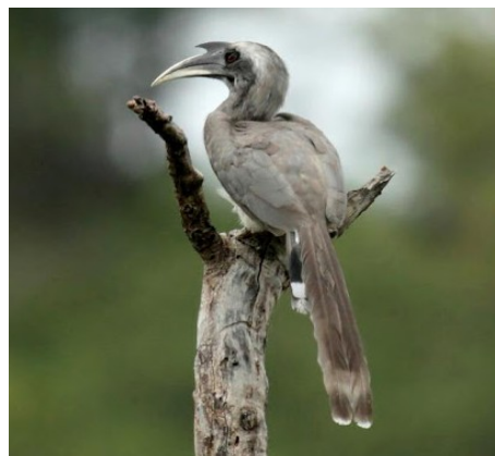
Indian Grey Hornbill, Urigam Range