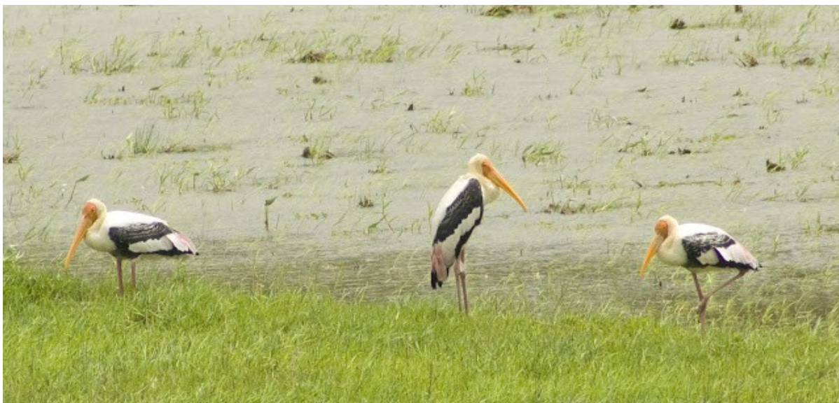
Painted Storks at Thally, Jowlagiri Range