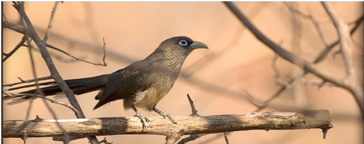
Small Green-billed Malkoha at Urigam Range

35 out of the 59 species that represent Biome-11 (Indo-Malayan Tropical Dry Zone) have been documented.