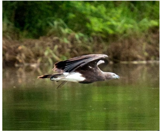
Lesser Fish Eagle Raasimanal, Anchetty Range