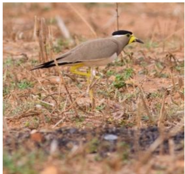
Yellow-wattled Lapwing, Aiyur, Denkanikottai Range